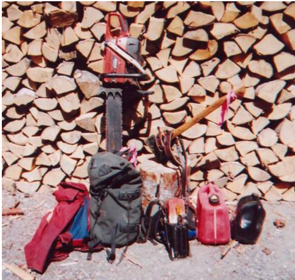
Soon as a Faller leaves the Crummy in the morning he has some form of weight attached to him until he returns at night.

Packing these weights on a daily basis is part of our general job description; could they be classified as contributing factors, most certainly, but there won't be much timber hitting the ground without any of the aforementioned gear. It will become evident further along why we've listed this. The weights are accurate, if anything, they're a little on the conservative side.