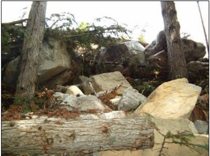
The road that was installed where these two trees got brutally damaged was on level ground, this was NOT necessary!

When we look at some of the Right of Way (RoW) allowances that have been laid out to access some areas of timber, there is no doubt in our minds, it was impossible for the road builders to keep debris out of our quarters on the low side of the road. Fallers can accept this.